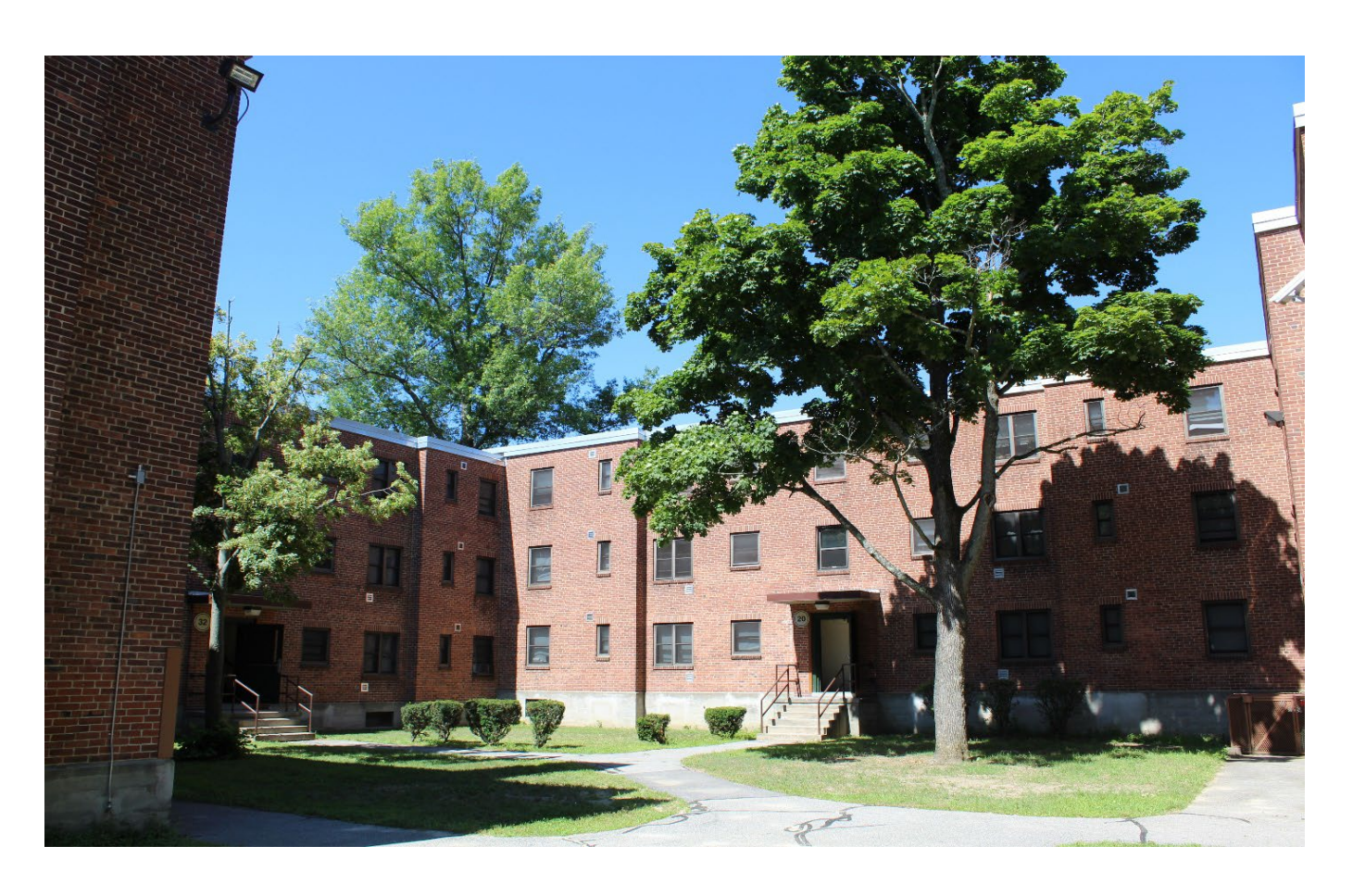
Above and below, current residential buildings at Lakeside Apartments