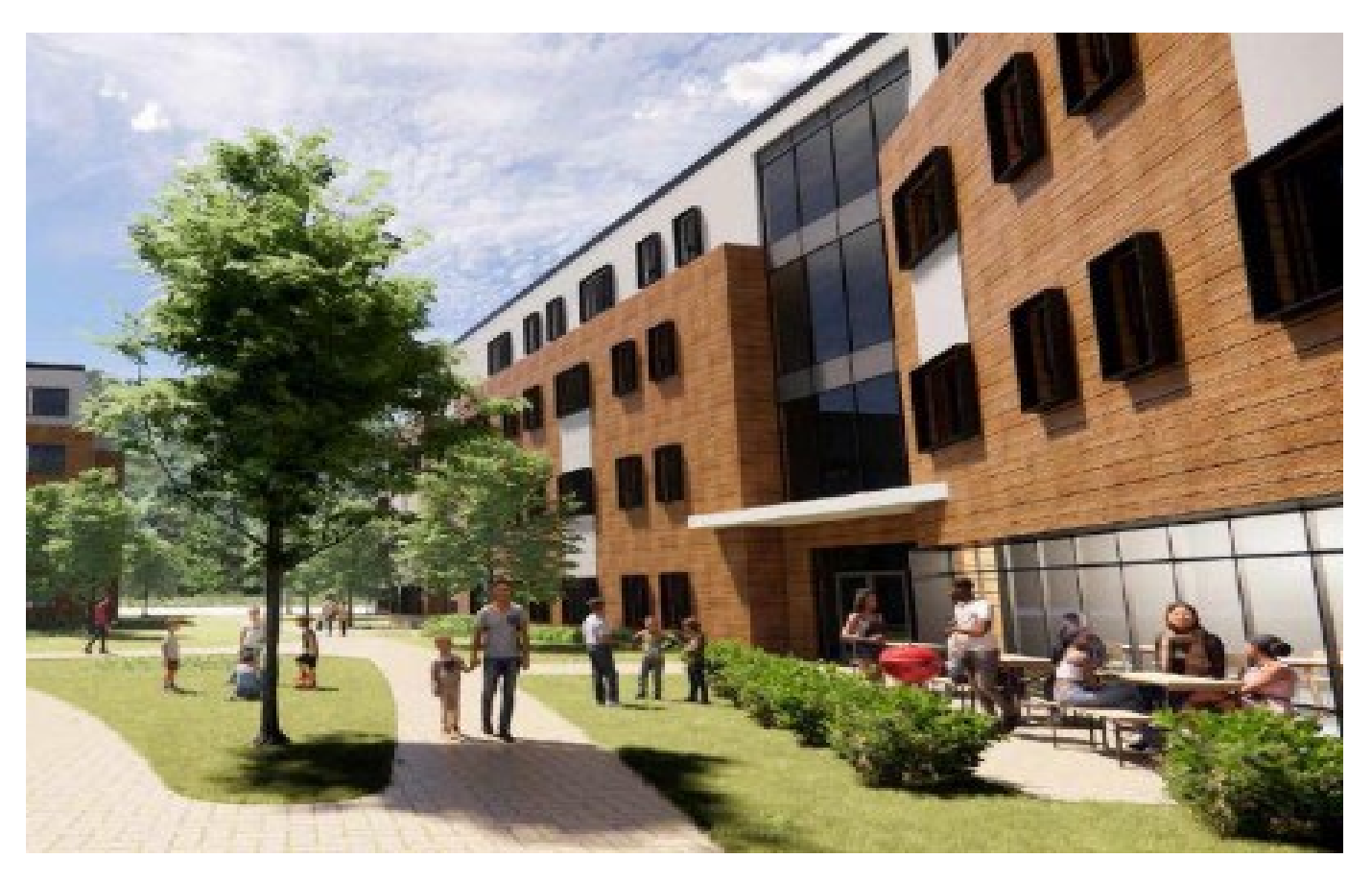
Above and below, an artist's rendering of the planned new Lakeside Apartments