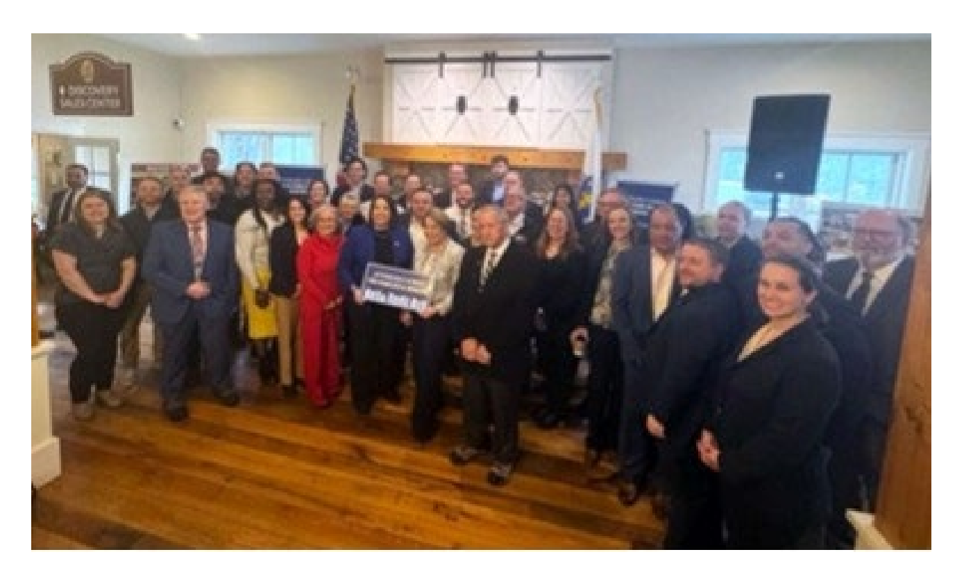
Attendees at Thursday's announcement of state funding for 14 affordable housing projects, including Lt. Gov. Kim Driscoll and Gov. Maura Healey (middle, holding sign)